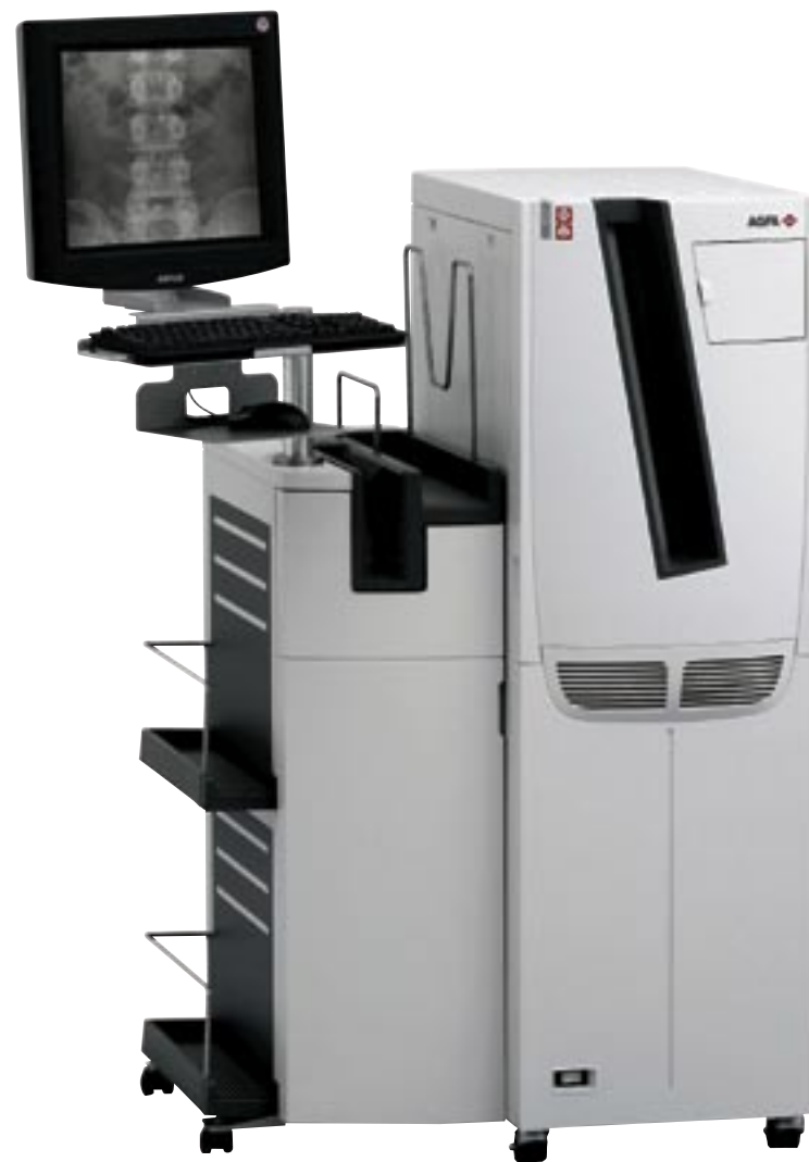
Quantum/Agfa CR25.0L, shown with optional CR User Station, which provides space for workstation, Cassette ID functionality and cassette storage.

The exclusive Quantum/Agfa CR25.0L Package includes: CR25 Single Plate reader CR QS server with 17" flat panel monitor CR QS On-Line Image processing Software with "MUSICA" CR QS ID software 2 CR 35 X 43 cassette/plate sets with MD-40-IP (SR) 2 CR 24 X 30 cassette/plate sets with MD-40-IP (HR) CR QS Dicom store/send and CR QS Dicom print.