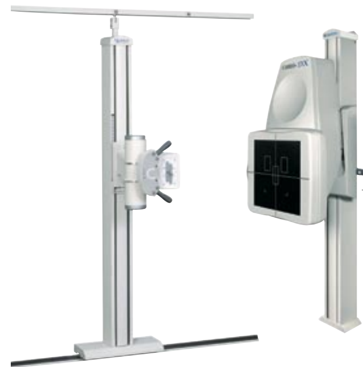
Chiro-DX Wall Stand

DR (Direct Radiography) is now available and affordable to the chiropractic professional. Quantum's advanced technology incorporates CCD Technology (Charged Couple Device) on the wall stand for efficient and cost effective solution. The Chiro-Dx system produces images in less than six seconds without the need for cassettes.