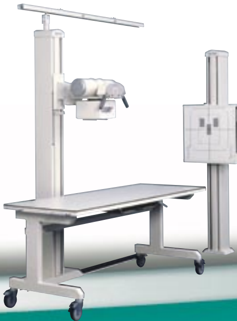
QS-506 Tubestand with VERTI-Q 14" x 17" Vertical Wall Stand (QW-420) and Mobile Table (QT-710)

QS-500 SERIES TUBESTAND Quantum's QS-500 Series tubestand is ideal for all chiropractic environments. The tubestand is easily positioned using the dual soft-grip handles. Fingertip controls permit easy access to multi-function lock release switches, including longitudinal, vertical and angulation. The handgrip also includes an easy-to-read angulation display for accurate indication of tube rotation and LED indicators to verify the SID.