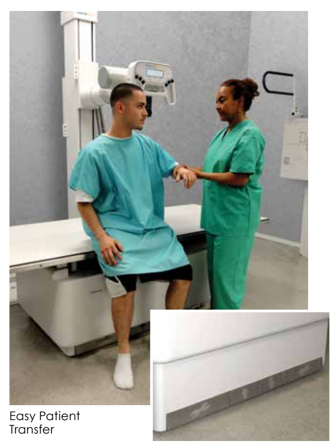
Convenient Lock-Release Pedals