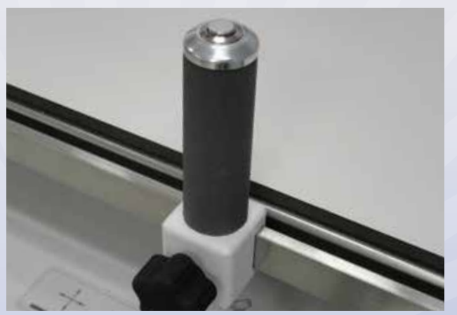
Table Lock Release Handle