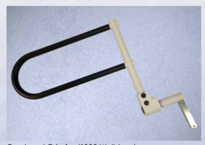
Overhead Grip for J1000 Wallstand