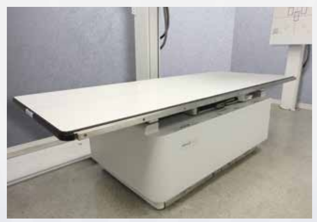
35.5" Wide Table Top