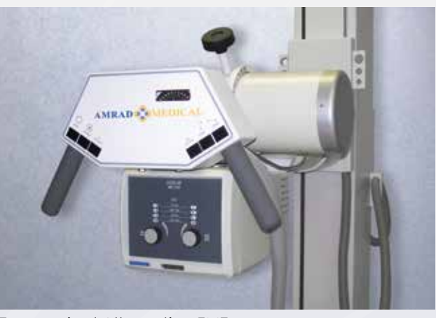
Economical Alternative FMT